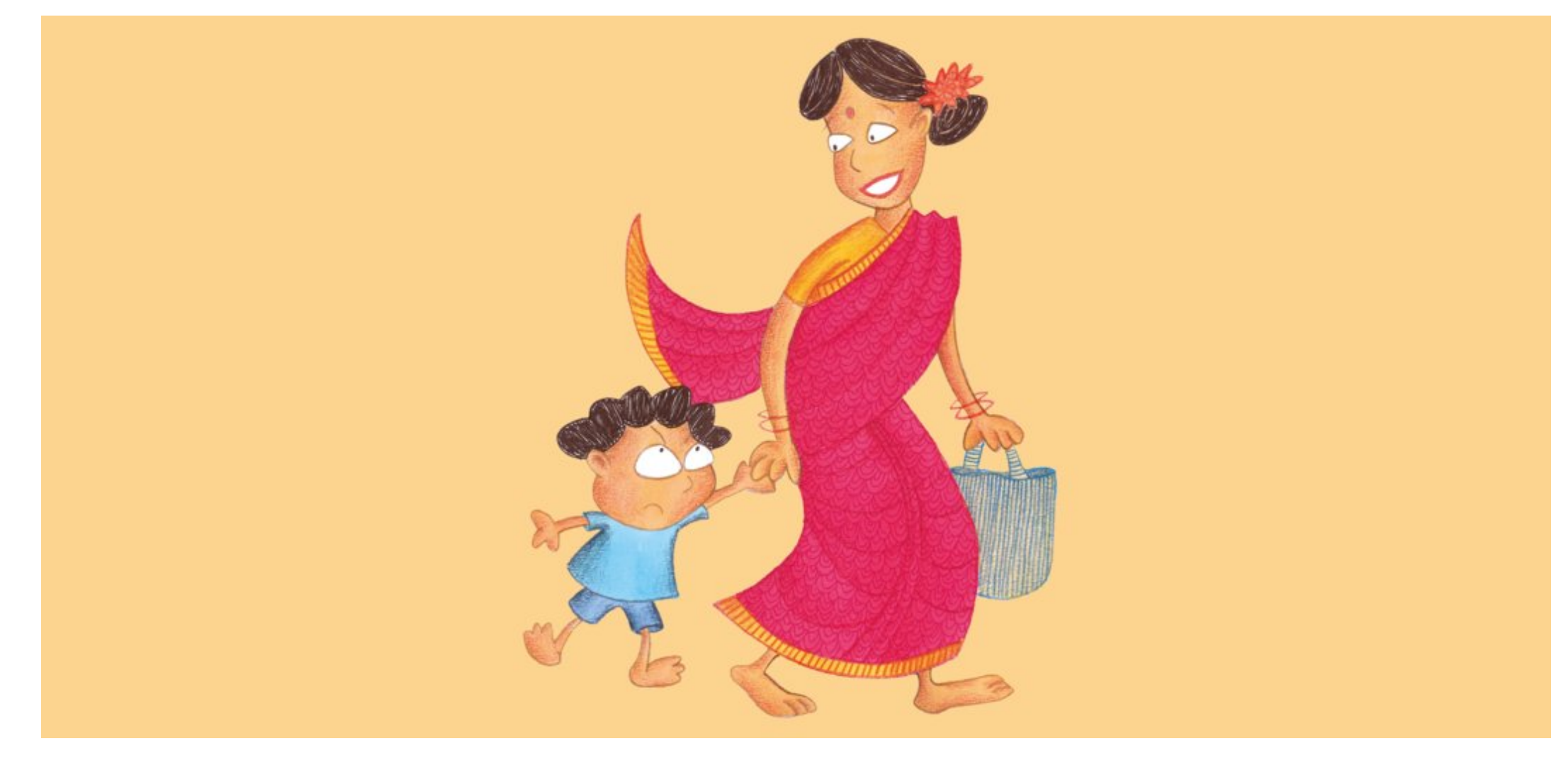
"Come, let's go to the market and get you something," said Amma.