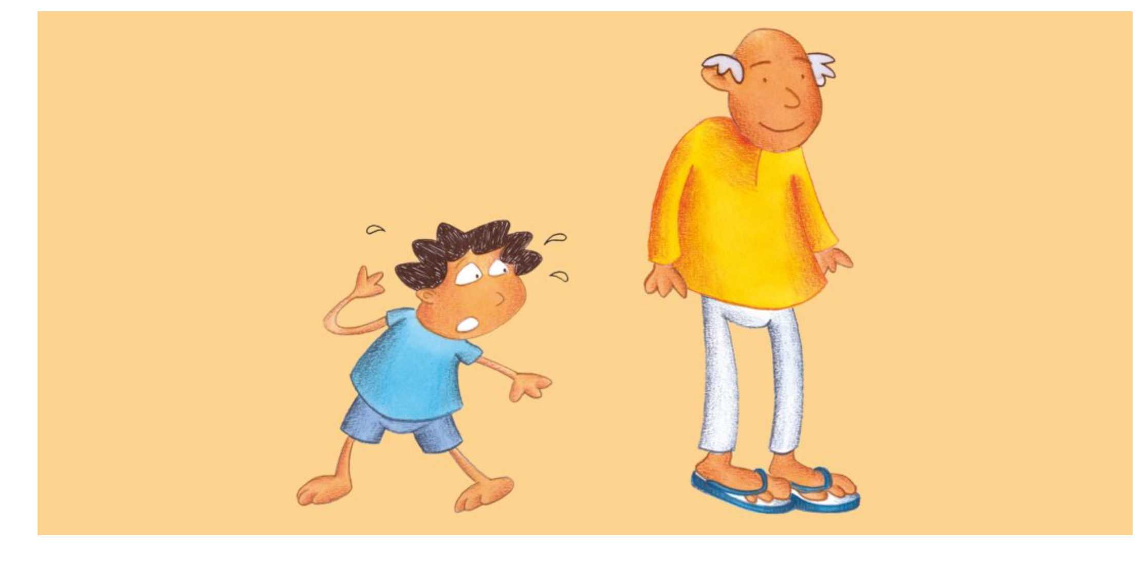
By now, Anil was crying loudly. Everyone was looking at Anil.